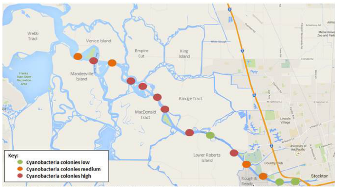
Figure of the San Joaquin River (Stockton Deep Water Ship Channel) showing densities of cyanobacteria (Microcystis) colonies